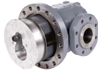
Removable B3-HPC Cartridge