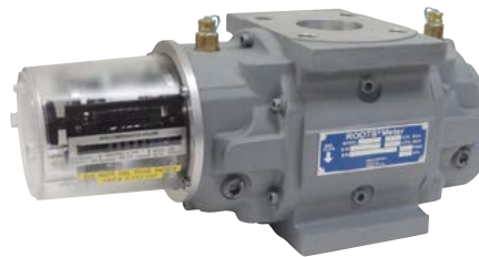
Series B3 2M/3M/5M Meter