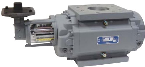
Series B3 7M/11M/16M Meter