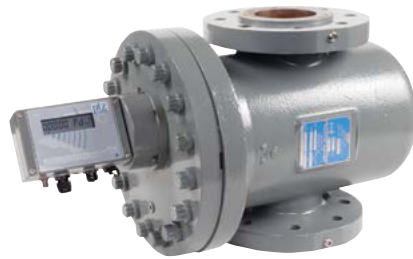
Series B3-HPC with Integral Micro Corrector