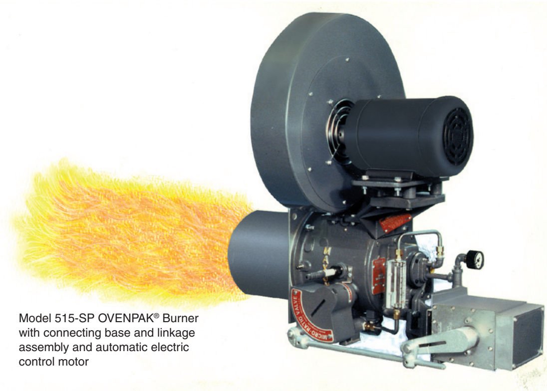
Model 515-SP OVENPAK® Burner with connecting base and linkage assembly and automatic electric control motor